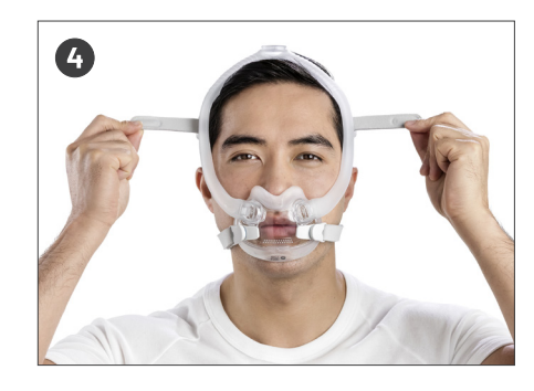
Undo the fastening tabs on the upper headgear straps and pull evenly.