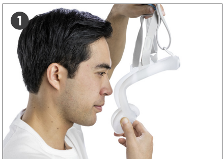
With one hand holding the bottom of the cushion and the other holding the conduit frame, position the mask in front of the face.