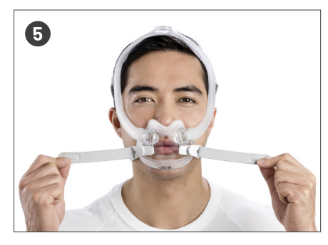
Repeat with the lower headgear straps.