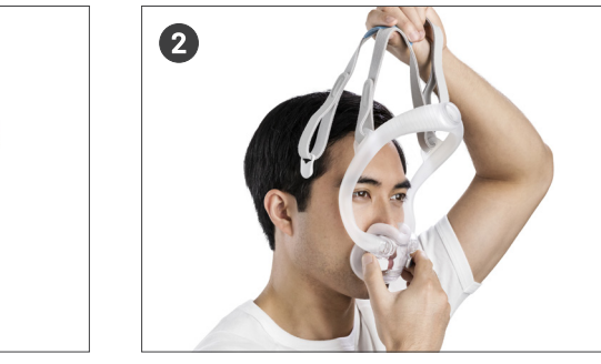
Place the cushion under the nose and against the face. With the ResMed logo and headgear facing up, pull the headgear over the head.