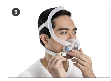
Bring the lower headgear straps under the ears and attach the magnetic clips to the frame connectors.